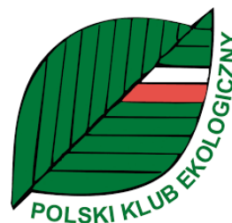
Polski Klub Ekologiczny, Poland